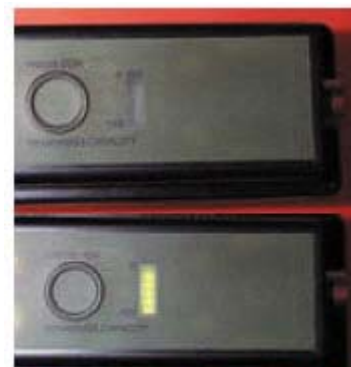
A battery for the military land warrior system utilizes a push button LED fuel gauge.

Often the system is designed with EMI protection but the connection to the battery pack is overlooked, therefore EMI signals are sent back through the battery connection and out of the battery causing interference. Some system designs are so critical that the battery pack needs to be shielded. The most cost-effective way to combat these circumstances is to place the battery pack in a shielded compartment of the system. To place shielding inside the battery pack is usually not cost effective, especially in applications where primary batteries are to be used. Adding shielding to the battery pack can increase the pack's weight and physical size.