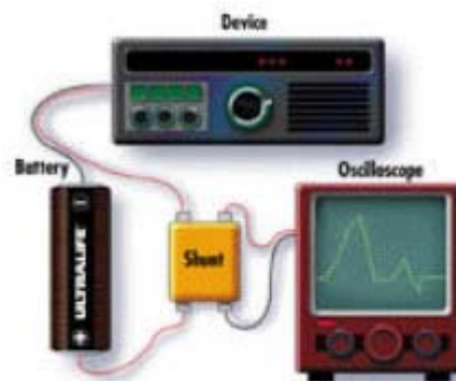
The setup of an oscilloscope and a shunt to monitor current requirements of a device.

The second key parameter needed for adequate battery design is the maximum current requirement. This is an important factor and will influence the battery designer's choice of protection circuitry, chemistry, wire and trace sizes and battery capacity. It is important to remember that the current used to design a system on a bench top using a power supply may be different than the current required from a battery. As discussed earlier, important parameters such as temperature, internal resistance of the battery, and the constant power discharge of a battery will often dictate higher currents at end of battery life. It is important to characterize the current requirement of the system over the entire usable voltage range. Current should always be measured using an oscilloscope and the voltage drop across a low resistance shunt (0.1W or 0.01W works well) of appropriate power rating, as a digital voltmeter will not allow the engineer to evaluate transient pulses correctly.