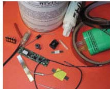
Many of the materials that consume valuable space within a battery pack, but which are of utmost necessity for a successful design.

Notice there has been no mention of physical size of the battery as a requirement. This is purposeful. Without the battery parameters properly defined as mentioned above, it is impossible to define the size of the battery required. Often it is done in the reverse order, since engineers and designers have a defined space to work with, and the battery gets what is left. This is not the best practice but unfortunately it is the one often used. It is possible to design a battery to fit in a space, even create custom cell sizes to accommodate space requirements, but it will often add cost and lead-time to a battery design, which usually is not a desired option. Materials such as cases, contacts, circuitry, wiring and even labels can quickly consume